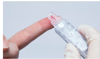
Required sample volume is only 1.5 \mu L.